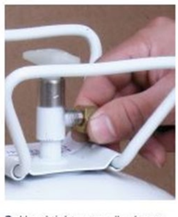
Hand tighten smaller hose end to canister.

42. The 3M Accused Products are designed to operate with and do operate with an attached hose and gun. For illustrative purposes only, below is an image of 3M/Northstar's PB910 Adhesive Spray Canister with an attached hose and gun: