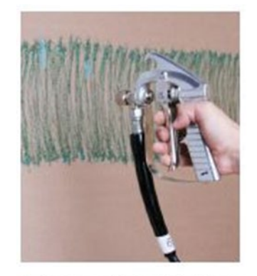
6: Turn gun trigger lock counter clockwise to open gun fully.

44. The 3M Accused Products' aerosol adhesive comprises a solvent mixture selected to have volatility characteristics for producing a specific spray pattern, which is identified as Methyl Acetate in the 3M/Northstar PB910 Adhesive Spray Canister.