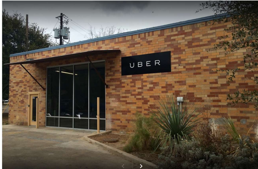
Uber's Greenlight Hub Facility in the Western District of Texas

E. On information and belief, instructing drivers in Texas and in the Western District of Texas about, and addressing drivers' questions regarding, Uber's services, which infringe Plaintiff's patents as set forth below.