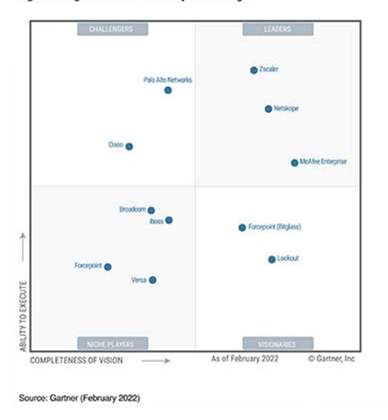
Figure 1: Magic Quadrant for Security Service Edge

34. Netskope is again identified as a market leader.