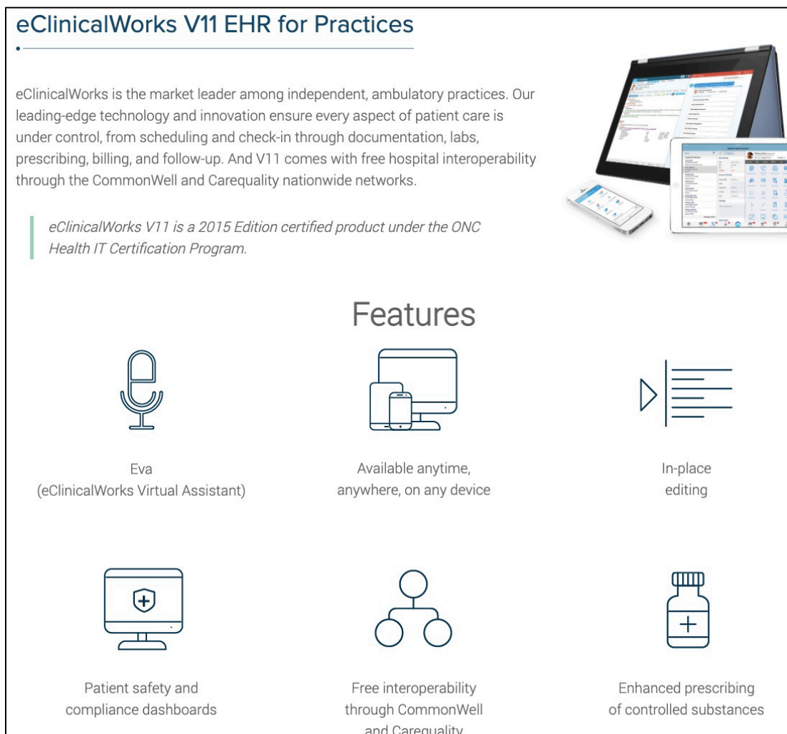
Figures 3 – Screenshot of Defendant’s webpage for V11 EHR and Practice Management webpage as visited on May 12, 2021 and located at https://www.eclinicalworks.com/products-services/ .