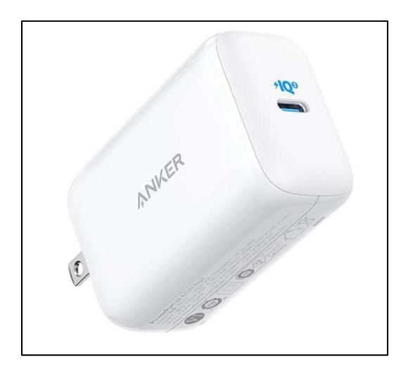
VII. COUNT 1: DIRECT INFRINGEMENT

45. Defendant, directly or through subsidiaries, intermediaries, and/or agents that it controls, manufactures, uses, and sells infringing devices and products, including, but not limited to, power adapters and converters compatible with USB Type-C plugs, such as the Anker A2712 PowerPort III 65W Pod (collectively "Accused Instrumentality"), which is pictured below: