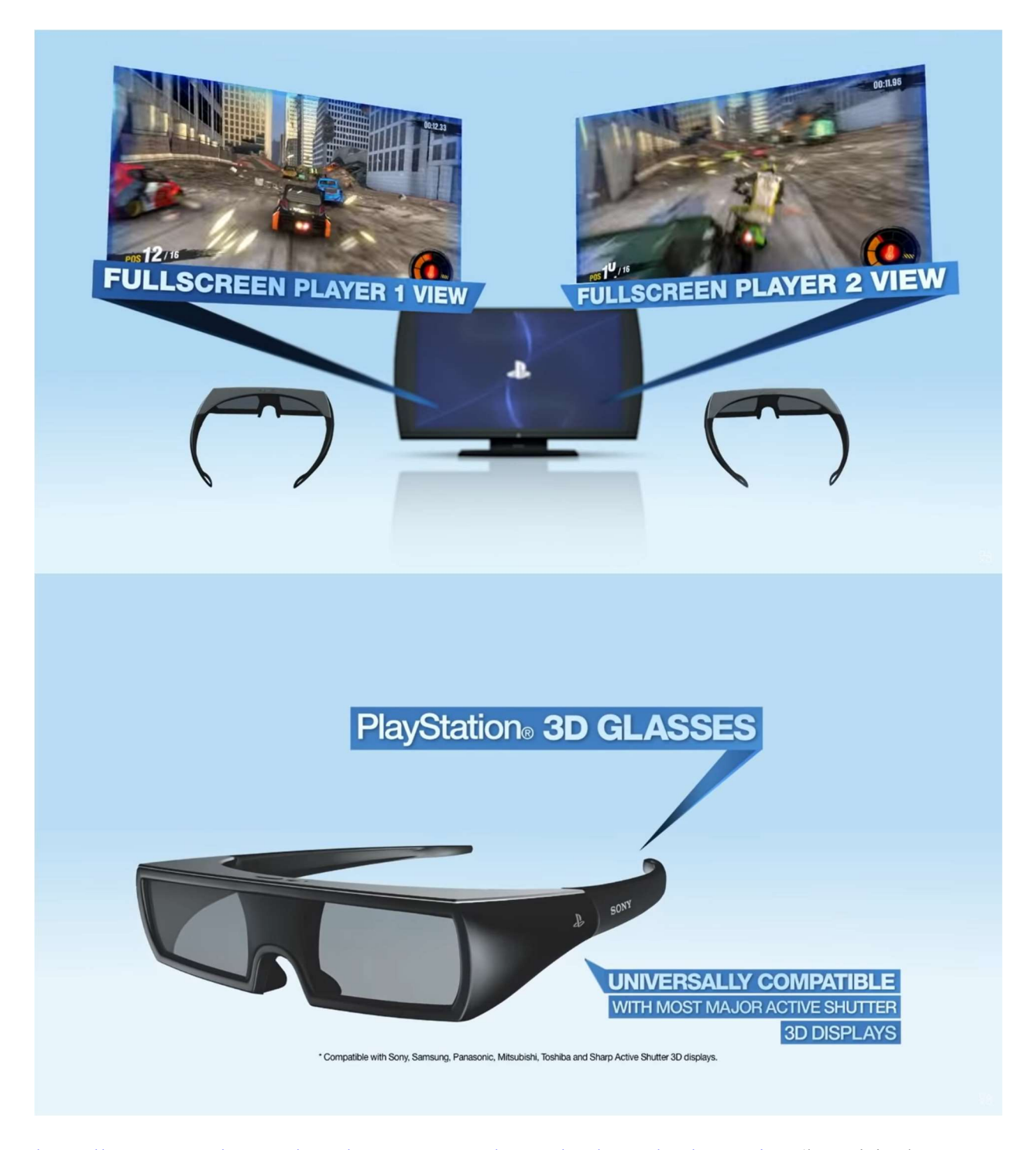
\underline{https://www.youtube.com/watch?v=y9JqTe\_ol1Q\&ab\_channel=PlayStation} \ (last\ visited\ June\ 13,\ 2022).

45. Sony offered the PlayStation 3 gaming console, PlayStation 3D Display Device, and TDG-SV5P SimulView Gaming Glasses (the "Accused Products") through at least 2016.