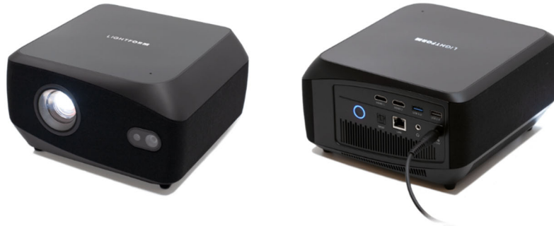
3 4 5 6 7 8 9 10 ( https://lightform.com/lf2plus )

1 The LF2+ is designed to be used in conjunction with Creator to create visuals. See 2 https://lightform.com/creator .