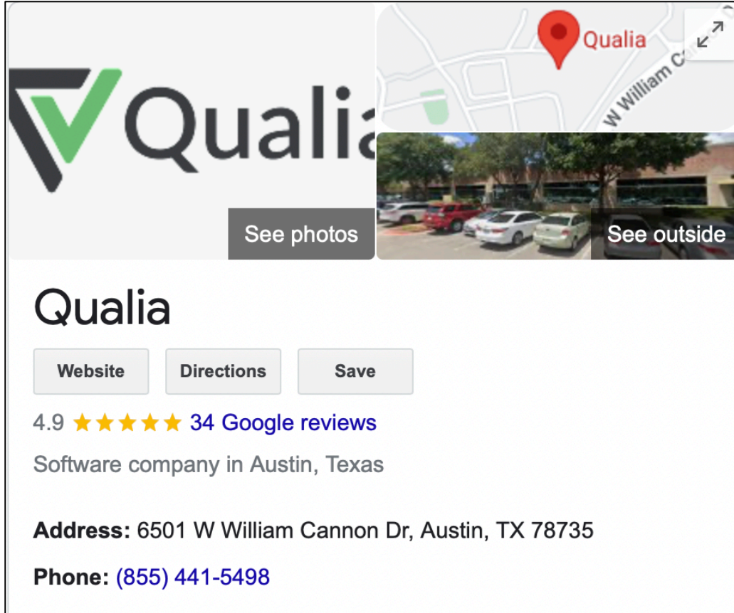
Figure 3 – Qualia’s Austin, Texas Location 1