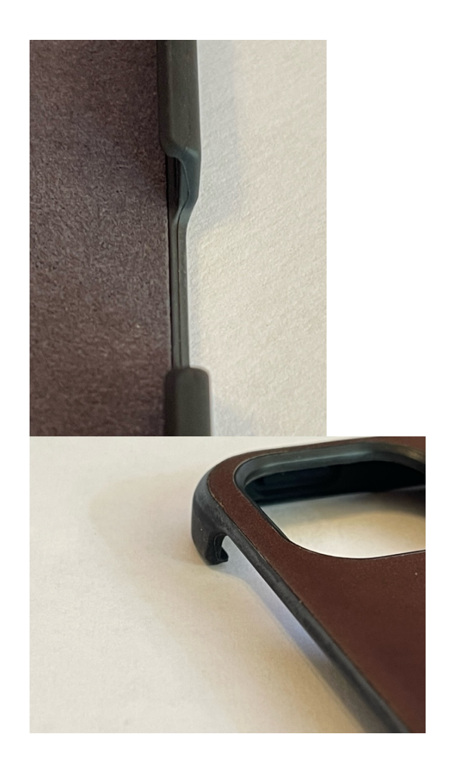
Modern Leather Case, iPad Pro 11 (3rd Gen) | Rustic Brown | Leather - iPad Pro 11-inch / Rustic Brown: https://nomadgoods.com/products/modern-leather-case-ipad-pro-11-3rd-gen-rustic-brown (See Exhibit C and pictures of representative products).