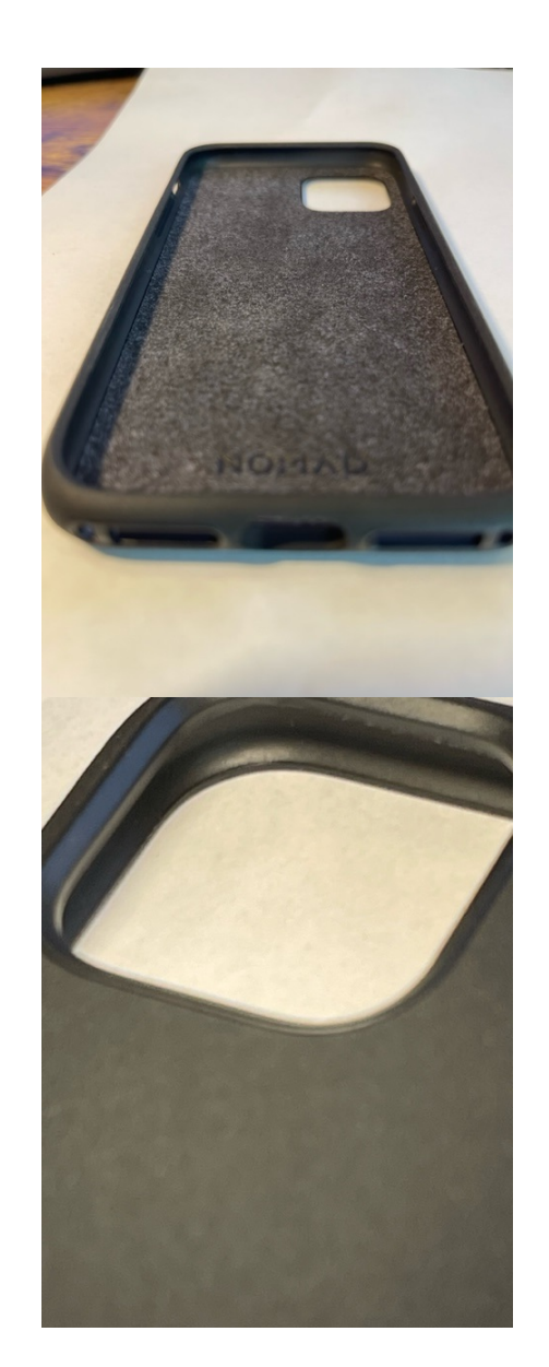
Active Rugged Case | iPhone 11 Pro | Black, iPhone 11 Pro / Black: https://nomadgoods.com/products/active-rugged-case-black-iphone-11-pro (See Exhibit C and pictures of representative products).

19. The Accused Products subject to this Complaint include all substantively similar products and any predecessor and/or successor versions that satisfy each limitation of, and therefore infringed, any asserted claim of the Asserted Patents whether sold directly or via any other online marketplaces or brick and mortar retail stores.