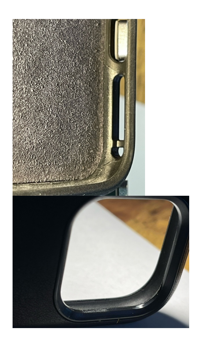
Modern Leather Tri-Folio | iPhone 11 Pro Max | Black, iPhone 11 Pro Max / Black: https://nomadgoods.com/products/rugged-tri-folio-black-iphone-11-pro-max (See Exhibit C and pictures of representative products).