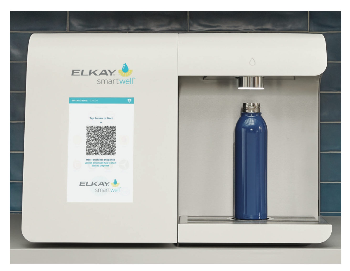
Figure 3 – Excerpt from the

https://www.elkay.com/content/dam/smartwell/resources/f_5535_smartwell_brochure_2_21 .pdf, as last visited on December 22, 2023.