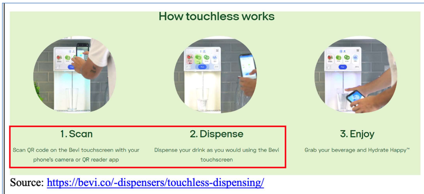
Figure 3 – Excerpt from the Defendant’s website. (Exhibit B at 2).

37. Defendant makes, uses, offers for sell, or sells within the United States and/or imports into the United States with its Touchless Water Dispenser, and related products that share the Accused Functionality, herein after “Accused Instrumentalities.”