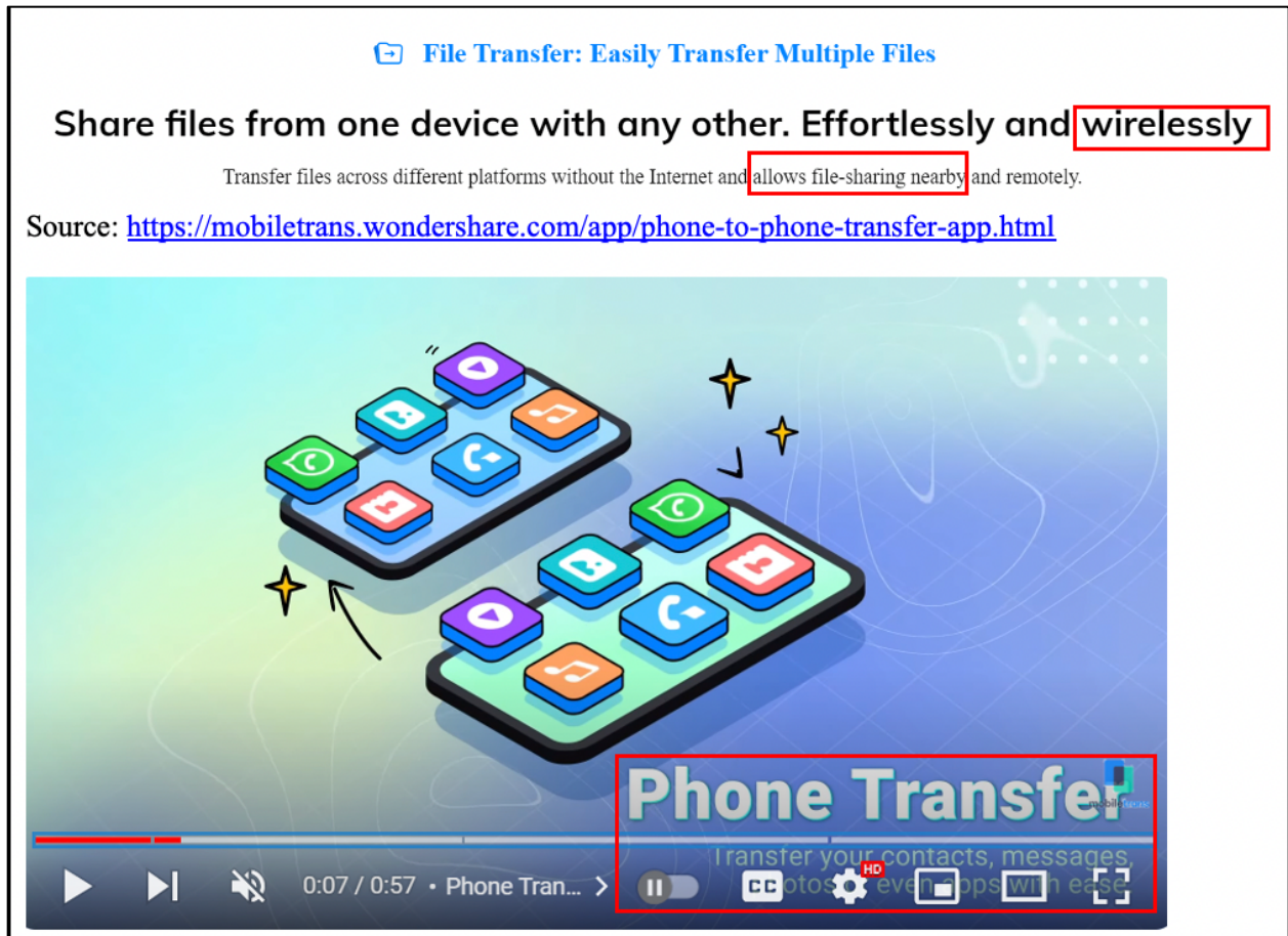
Figure 2 – Source: https://www.youtube.com/watch?v=WuBk-YjJlI4 , at 0:07, as last visited on January 24, 2024.

18. Furthermore, the Android phone and the iPhone do not require users to input the email and the password every time they communicate. Instead, the email and password input are necessary ("security measure") during the initial connection process, and thereafter, the devices automatically exchange data without requiring users to re-enter the email and password. Additional description is of infringement is contained in Exhibit B .