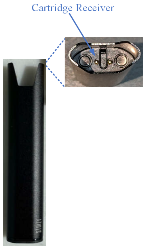
Figure 3: Illustration of cartridge receiver

24. Upon information and belief, Defendants' Accused Products include at least STIIZY 1 Gram Vaporizer Cartridge, STIIZY 0.5 Gram Vaporizer Cartridge, STIIZY (Original) Vaporizer with STIIZY 0.5 Gram Vaporizer Cartridge, STIIZY (Original) Vaporizer with STIIZY 1 Gram Vaporizer Cartridge, STIIZY BIIG Vaporizer with 0.5 Gram Vaporizer Cartridge, STIIZY BIIG Vaporizer with 1 Gram Vaporizer Cartridge, STIIZY LIIL Vaporizer, and components thereof.