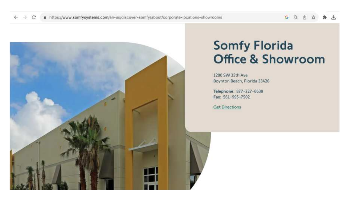
FIG. 1: Locations and Showrooms, SOMFY, https://www.somfysystems.com/en-us/discover-