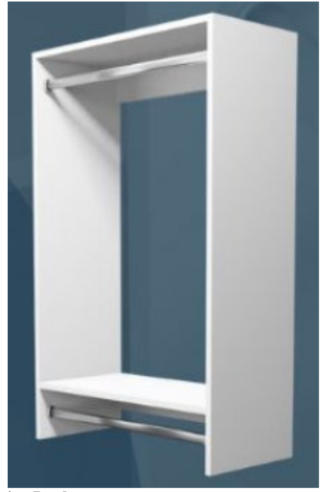
The Infringing Product