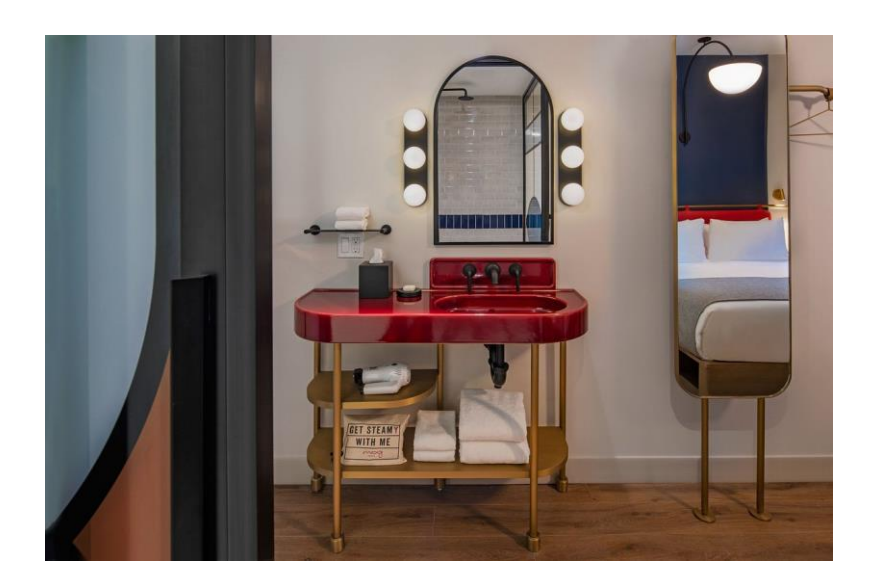
Accused Light Fixtures