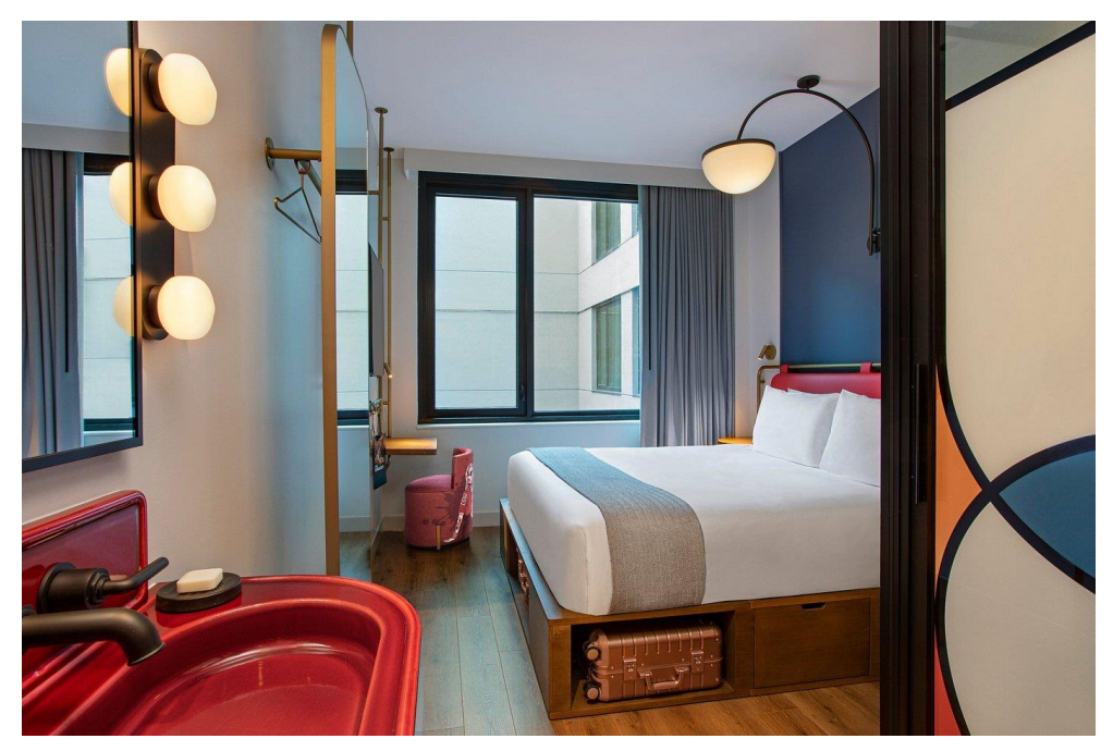
Accused Light Fixtures

42. On information and belief, instead of utilizing RBW's Pastille<sup>TM</sup> sconce, Defendants, Stonehill, Boyd, Lightstone and/or Bowery Street designed, specified, sourced and directed the manufacture of unauthorized knock-off copies of RBW's Pastille<sup>TM</sup> sconce (the Accused Light Fixtures) for use in the Moxy Hotel.