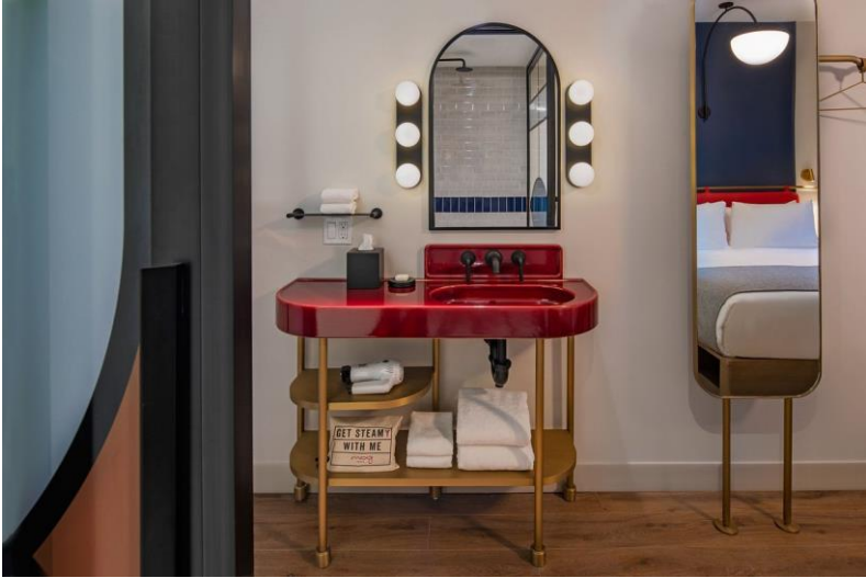
Accused Light Fixtures