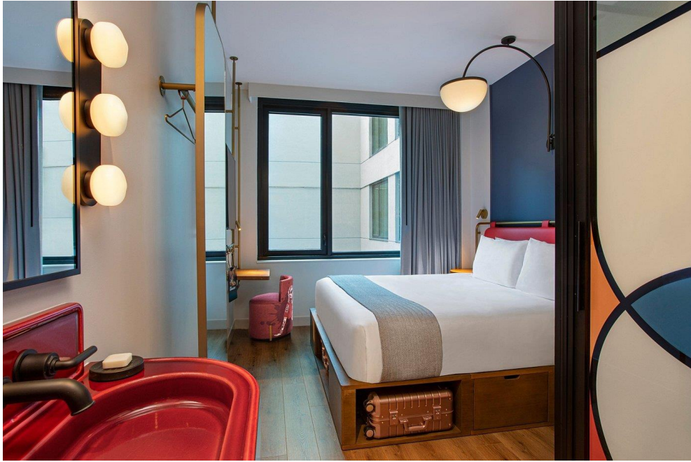
Accused Light Fixtures

42. On information and belief, instead of utilizing RBW's Pastille™ sconce, Defendants, Stonehill, Boyd, Lightstone and/or Bowery Street designed, specified, sourced and directed the manufacture of unauthorized knock-off copies of RBW's Pastille™ sconce (the Accused Light Fixtures) for use in the Moxy Hotel.