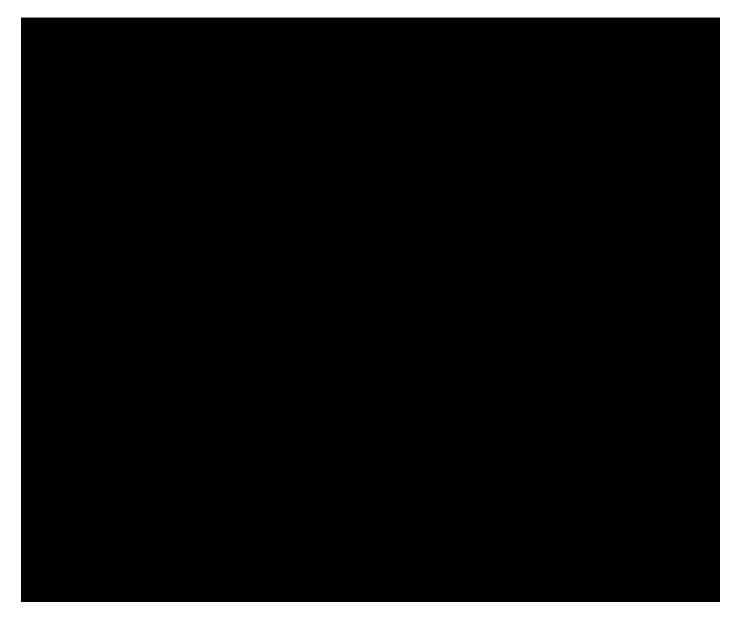
Exhibit 2 Figure 3 Plaintiff's Website (www.wiesnerhealth.com)

19. On information and belief, Defendants, either individually or jointly, operate one or more e-commerce stores under the Seller Aliases listed in Schedule A attached hereto. Tactics used by Defendants to conceal their identities and the full scope of their operation make it virtually impossible for Plaintiff to learn Defendants' true identities and the exact interworking of their infringing network. If Defendants provide additional credible information regarding their identities, Plaintiff will take appropriate steps to amend the Complaint.