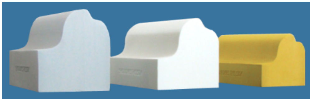
Plaintiffs' Cervical Denneroll orthotic devices

16. One of Denneroll's products is known commercially as the Cervical Denneroll device, which is available in different sizes (large, medium and small) as shown in the below image: