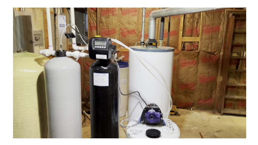
Figure 3: Image of the Infringing System