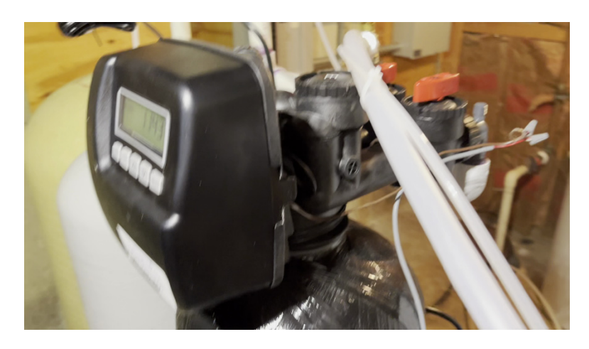
Figure 5: Another Image of the Infringing System