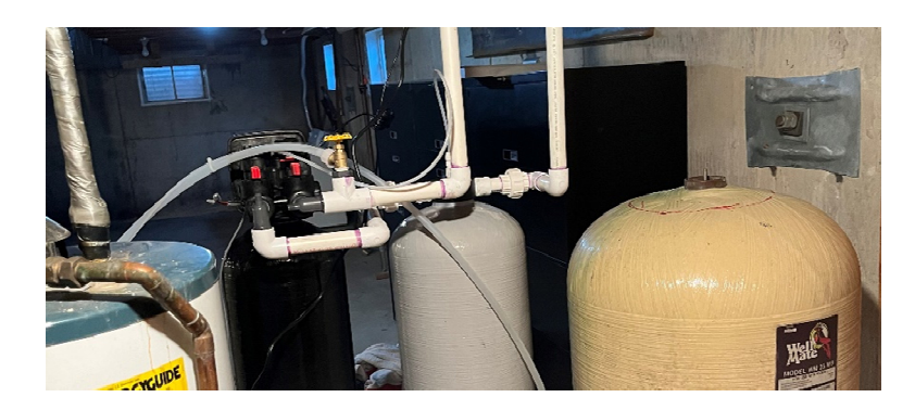
Figure 7: Another Image of the Infringing System