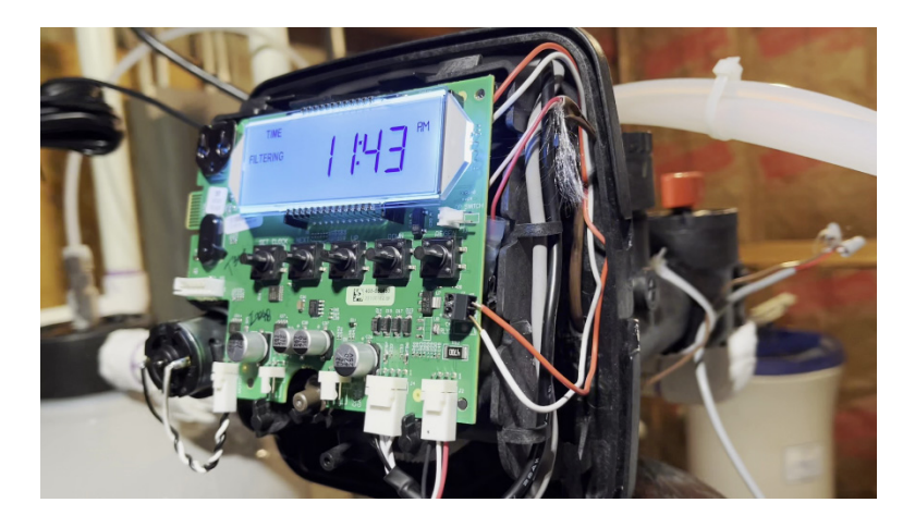
Figure 8: Another Image of the Infringing System