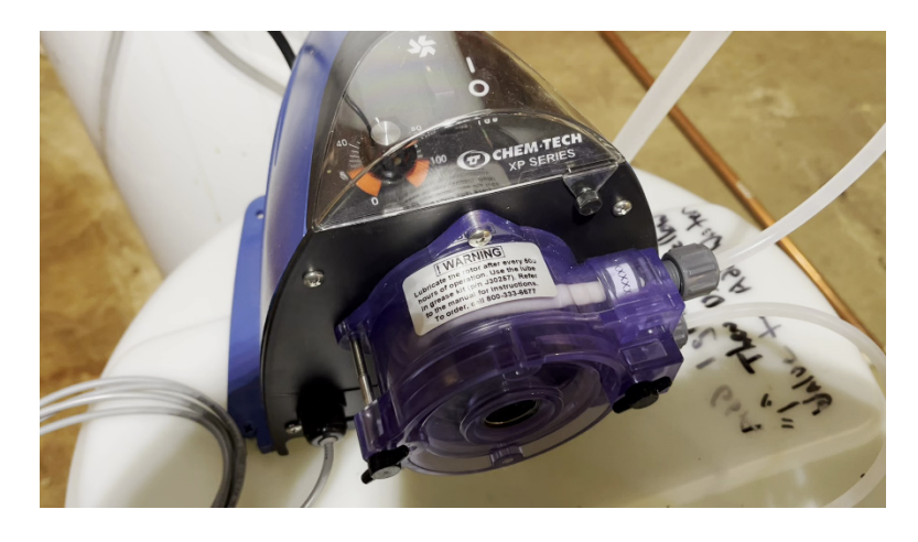
Figure 4: Another Image of the Infringing System