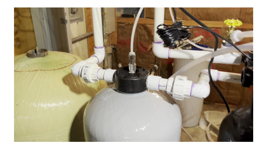
Figure 6: Another Image of the Infringing System