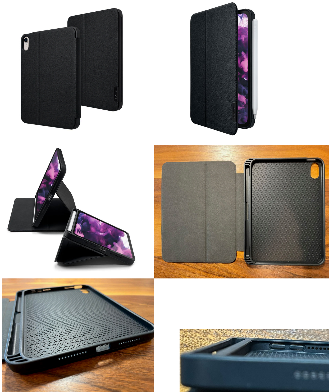
PRESTIGE FOLIO case with Pencil Holder for iPad mini 6 (2021) Black: https://www.itslaut.com/products/prestige-folio-case-with-pencil-holder-for-ipad-mini-6-2021 (See Exhibit C and pictures of representative products).