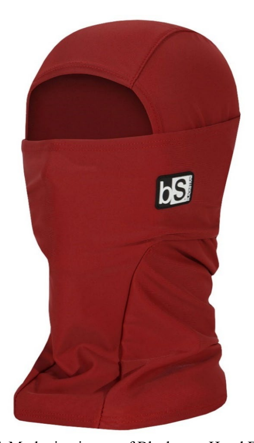
Figure 5. Marketing image of Blackstrap Hood Balaclava

10. The balaclava design protected by D'703 patent is embodied by Blackstrap's Hood Balaclava product, shown below: