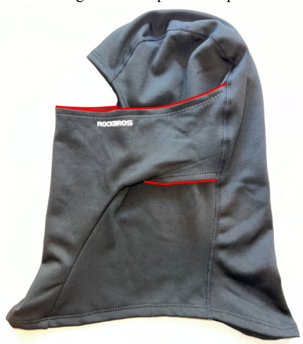
Figure 9. Side view of Rockbros Balaclava, annotated to illustrate detached horizontal edges of T-shaped mouthpiece