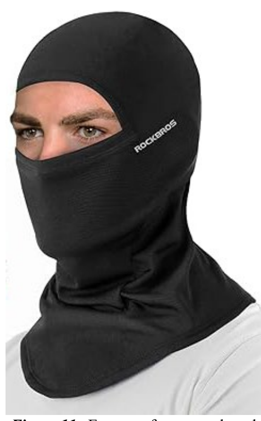
Figure 11. Excerpt of current, altered marketing image from Amazon listing

However, the T-shaped mouthpiece can still be seen in other marketing images. See Ex. C. When purchased, contrary to the altered image, the product delivered is an infringing Rockbros Balaclava.