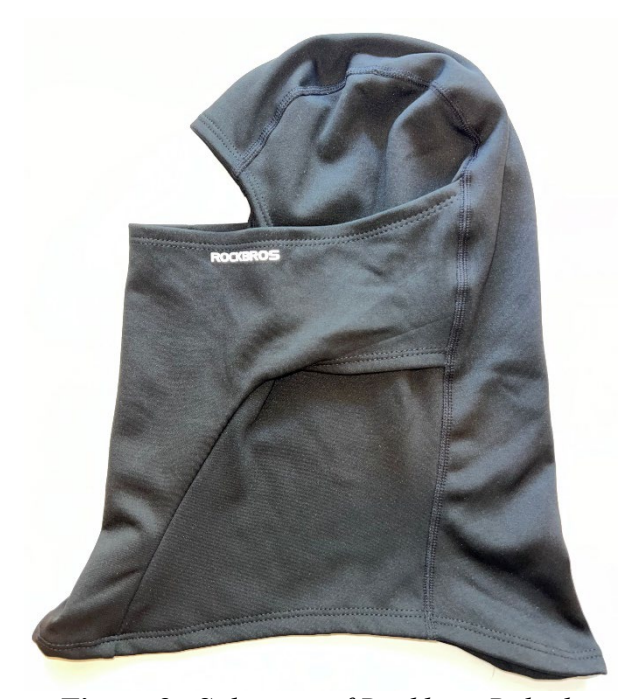
Figure 8. Side view of Rockbros Balaclava