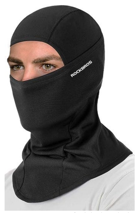
Figure 10. Excerpt of original marketing image from Amazon listing<sup>6</sup>

design similarities to the D'703 Patent, including the detached horizontal portion of the T shaped mouthpiece section, as shown below: