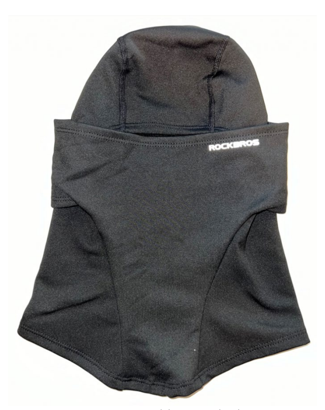
Figure 6. Rockbros Balaclava