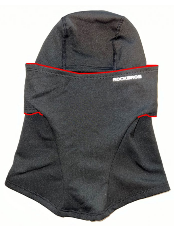
Figure 7. Rockbros Balaclava, annotated to illustrate detached horizontal edges of T-shaped mouthpiece