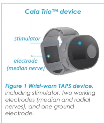
Figure 1 Wrist-worn TAPS device, including stimulator, two working electrodes (median and radial nerves), and one ground electrode.

4.84 cm 2 electrodes embedded in the band.” (Cala Health, 510(k) Summary / 510(k): Device Modification [K203288], p. 4, Oct. 4, 2021). Cala Health has explained that the Trio includes at least one electrode positioned over a smooth skin surface (inner wrist) overlying a target nerve or tissue which extends through a hand of the subject: