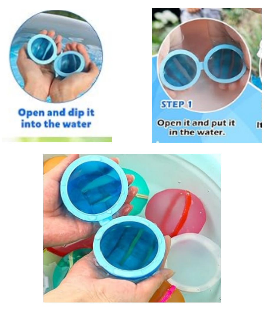
DEFENDANTS' INFRINGEMENT OF PLAINTIFF'S REGISTERED SOPPYCID TRADEMARK AND VIOLATION OF LANHAM ACT § 43(a)

22. Defendants are marketing products that directly infringe the claimed design of the D'861 patent ("the Accused Products"). Representative reproductions from Defendants' web pagesclearly show direct infringement.