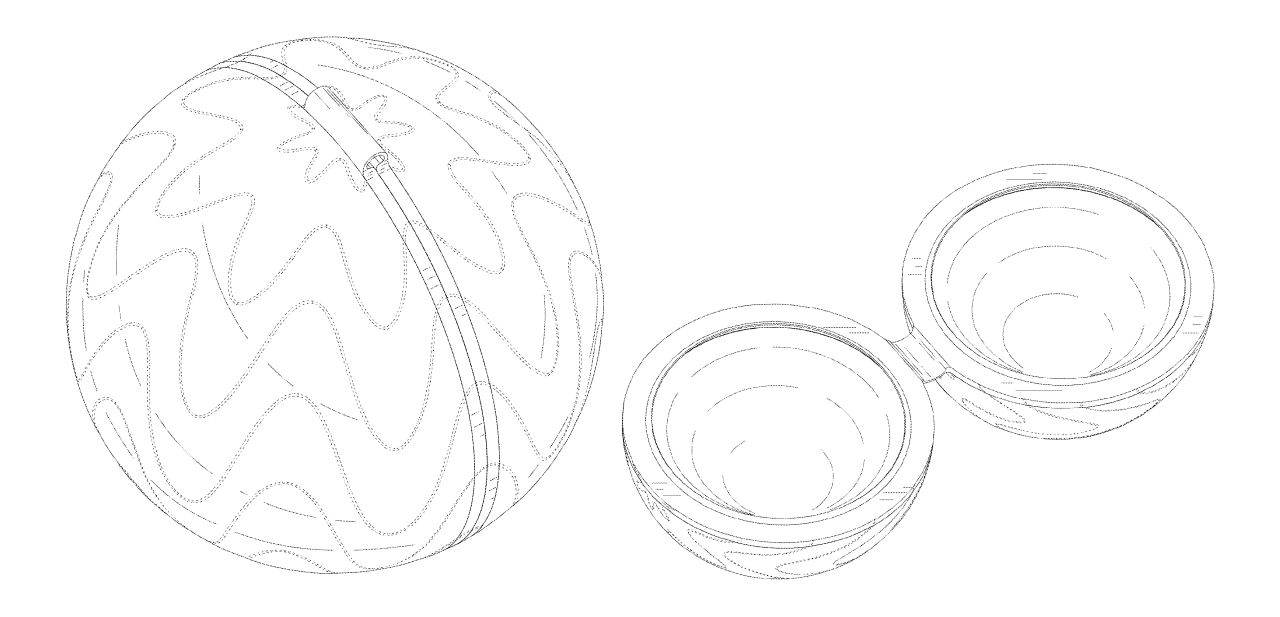
FIG. 1 FIG. 2

Case: 1:24-cv-08111 Document #: 1 Filed: 09/05/24 Page 6 of 15 PageID #:6