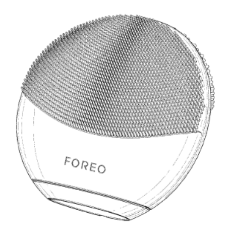
Figures from the Design Patents